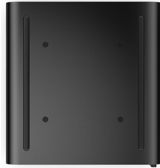
HP Z2 G9 Mini Workstation Desktop PC, bottom view

Removable VESA cap for access to integrated VESA mounting holes